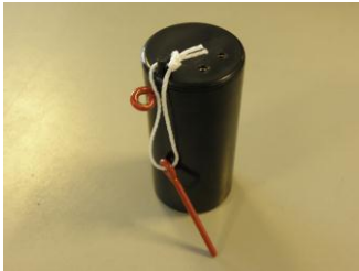
Product no. 2000 (Lite GB) Product no. 2010 (Master 1)

In case of an inflatable life raft the light is provided with a cord attached to the pin, so the pin automatically during inflation will be pulled away from the light. The light can be turned off by using the spare pin attached to the light.