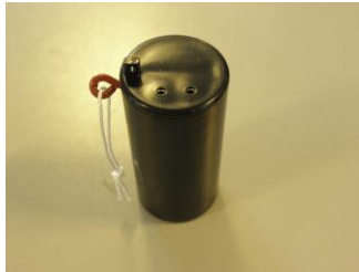
Product no. 2001 (without extra pin)